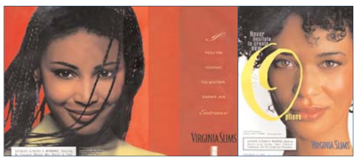
"Sometimes I need a moment to catch up with Myself."

"The world is my oyster, and I love pearls."