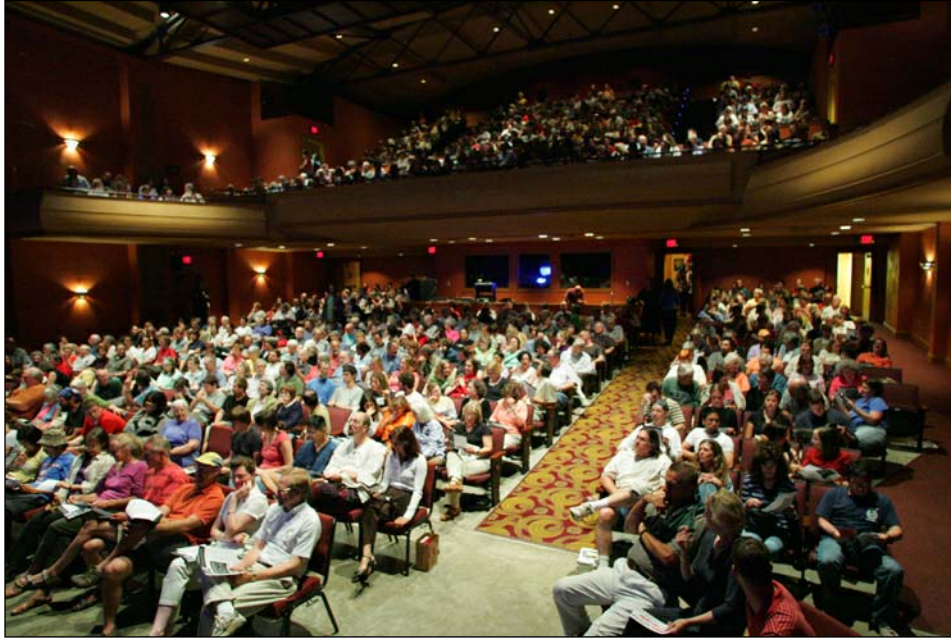
Audience from Bloomington, Indiana screening at the Buskirk-Chumley Theater of Hijacking Catastrophe (June 21, 2004)

9/11, Fear & the Selling of American Empire