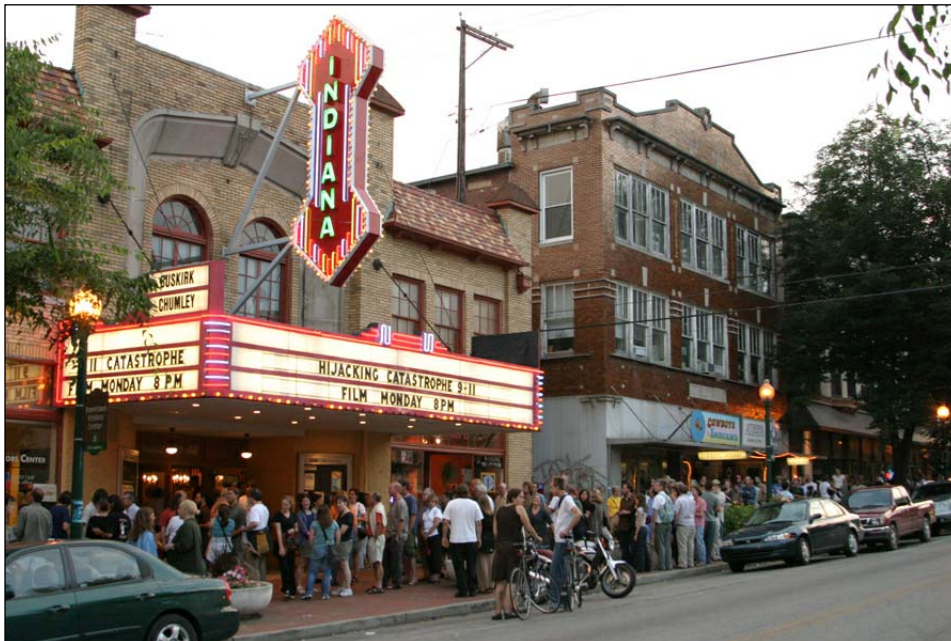
Ticket line from Bloomington, Indiana screening at the Buskirk-Chumley Theater of Hijacking Catastrophe (June 21, 2004)