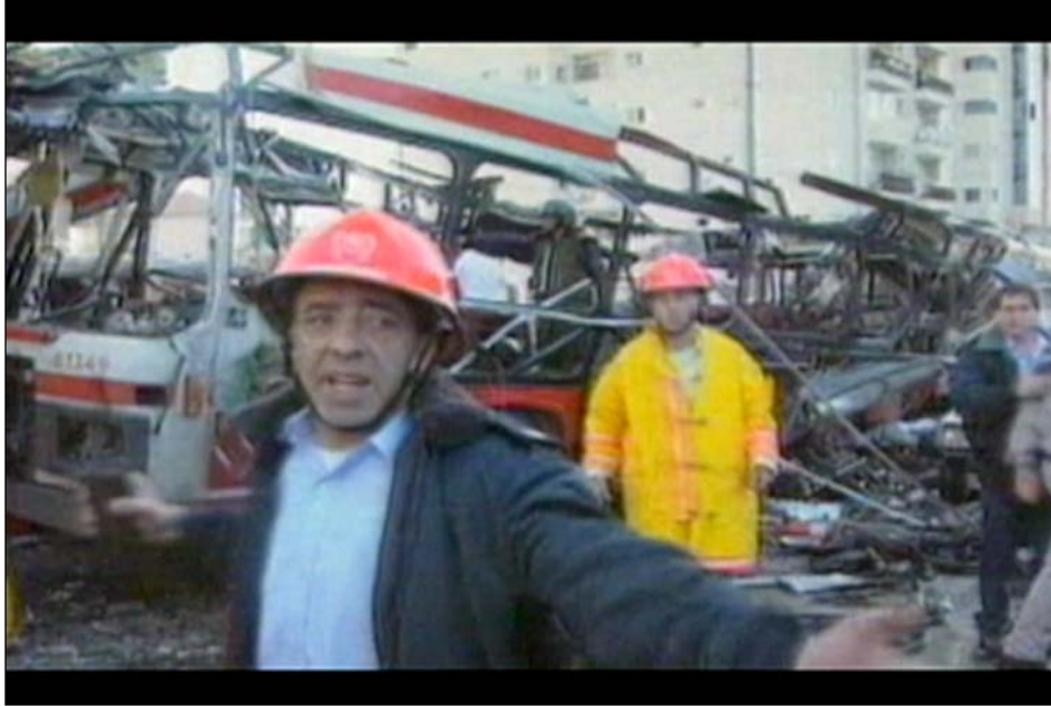
Aftermath of a suicide bombing in Israel, from Peace, Propaganda & the Promised Land .