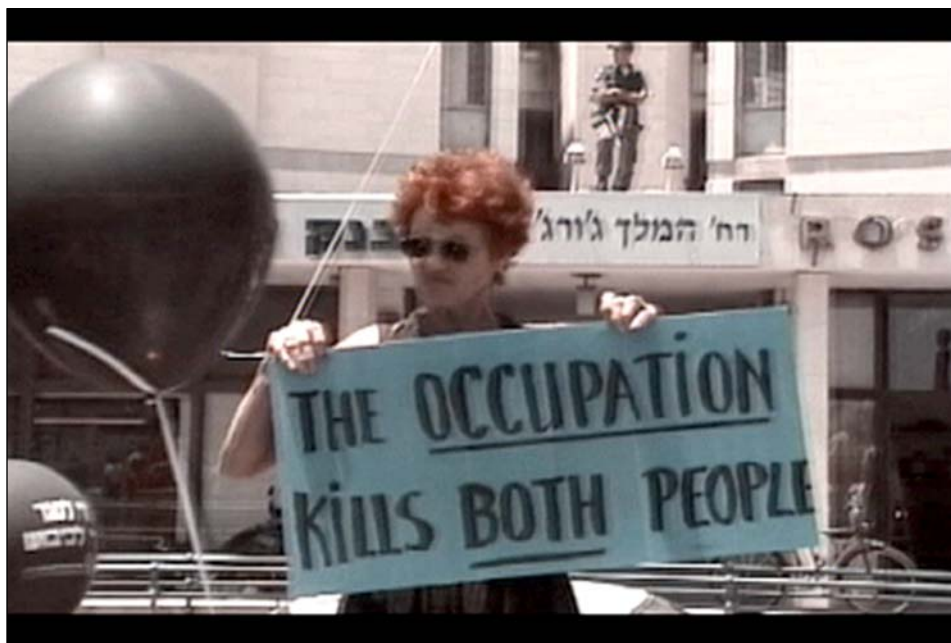
Israeli peace activist, from Peace, Propaganda & the Promised Land .