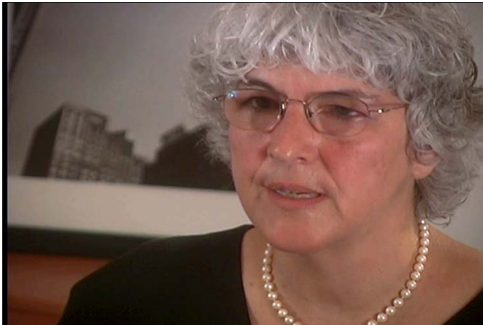
Gila Svirsky interview still from Peace, Propaganda & the Promised Land .