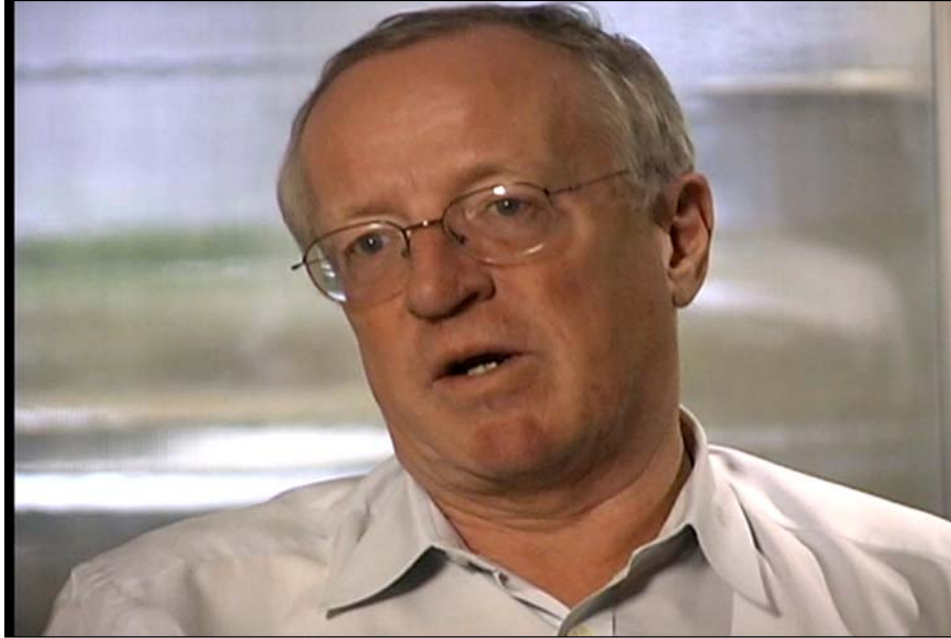
Robert Fisk interview still from Peace, Propaganda & the Promised Land .