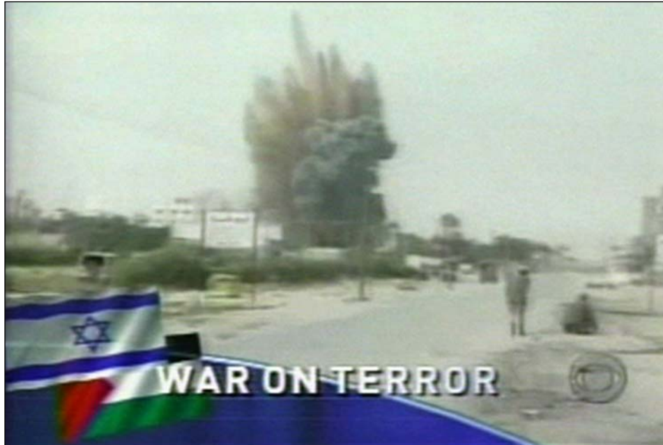
American news report, from Peace, Propaganda & the Promised Land .