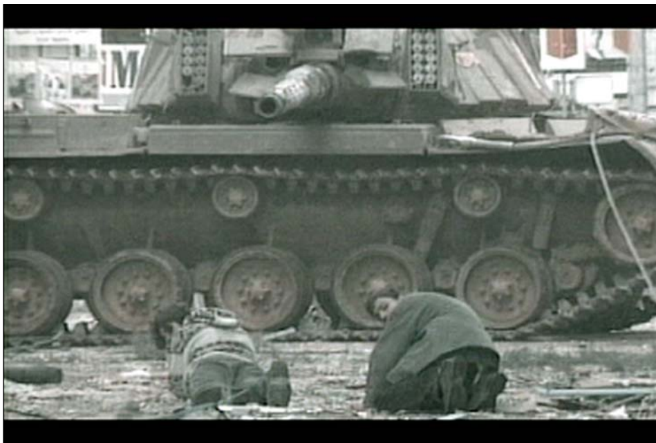
Palestinians in front of an Israeli tank, from Peace, Propaganda & the Promised Land .