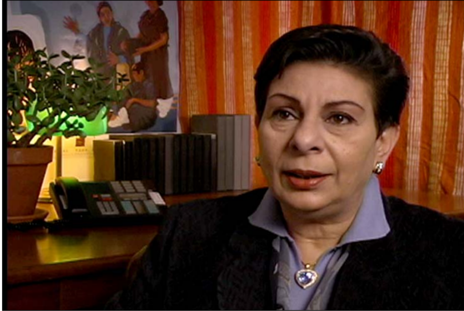
Hanan Ashrawi interview still from Peace, Propaganda & the Promised Land .